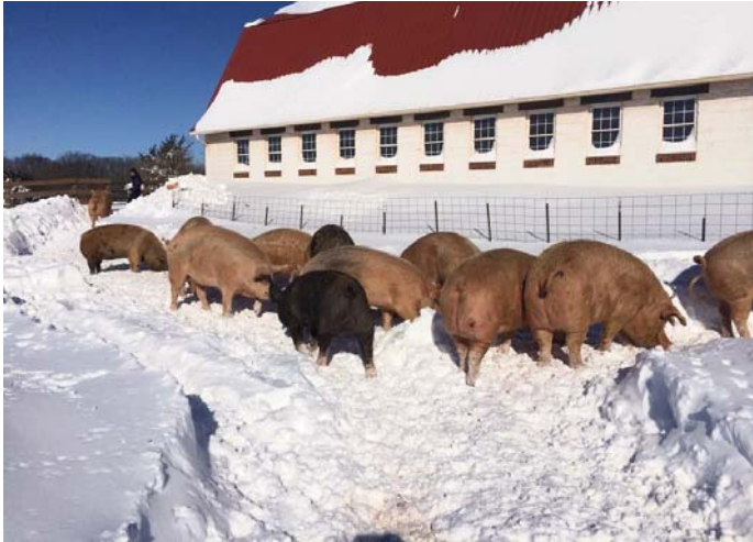
Paths had to be shoveled through the snow for the pigs

us to take in several new goats this year, including two gorgeous long haired pygmy goats Caleb and Reggie, and Barnaby, our first fainting goat. They were all found wandering down a highway in