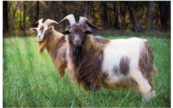
Caleb and Reggie

we still had a record number of supporters, and raised an amazing $80,000. for the rescued animals. Many friends and local businesses contributed fabulous food and drink for the event, and we auctioned off over 300 generously donated items in our silent auction. In November, over 1,000 people attended our Thanksgiving with the turkeys. The huge potluck offered more than a hundred delicious plant based