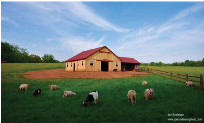
New goat barn

In addition to goats, many other new animals were rescued this year, including