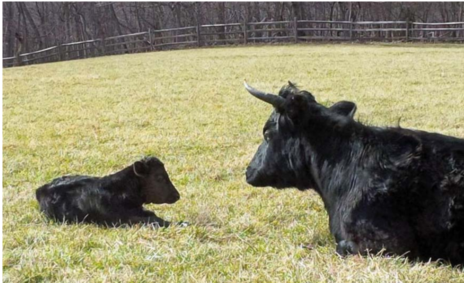
Ruby and baby Lucas, happy and safe

The day after their arrival they were let out of their stall and Lucas, who had never before seen grass, ran and bucked and kicked with excitement, racing around his happy mom with joyful abandon. These two beautiful animals, whose fate seemed destined for tragedy, will now get to live together happily as a family for the rest of their lives, grazing and strolling the fields and woods, a wonderful life that all cows should be allowed to live. ■