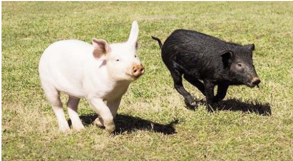
Best friends Wee Wee and Scooter

Sometimes a rescue is almost like a fairy tale. Everything needs to come together perfectly for it to happen. And so was the unlikely rescue of Wee Wee, a tiny piglet who somehow, some way, escaped his fate and made a daring leap from a transport truck that was taking him to auction. It was, literally, a dark and stormy night. The truck was full of hundreds of other piglets, taken from their mothers at only two weeks of age, so that the mothers could be rapidly impregnated again and the farmer could make the most profit. Wee Wee would