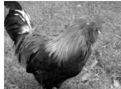
Alvin, found in a cardboard box

Another lucky animal is Alvin the rooster. Animal control officers in Maryland were called to a home with a report that there was a goat tied on the deck of a townhouse. When they arrived on the scene, there was nothing left except blood and hair. And a cardboard box.