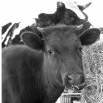
Aggie, happy in her new home

from a nearby livestock auction which had recently held a sale. Nobody claimed the little calf, who was only a few months old, and who thankfully wandered onto a