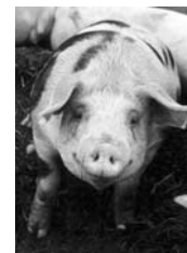
Priscilla, happy to be rescued

we had spread around the pasture for them. In the morning we saw a sight that brought tears to our eyes – these pigs, who had been born and raised in a factory farm and had never seen the light of day, had never been out of a small indoor enclosure, were walking shoulder