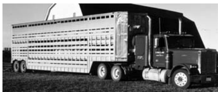
171 pigs were stacked 3 levels high in this trailer

On January 1, 1997 Poplar Spring officially opened its barn doors, and it has now been 15 fulfilling years of providing a safe and loving home to hundreds of farm animals rescued from abandonment, abuse and neglect. Over the years there have been so many