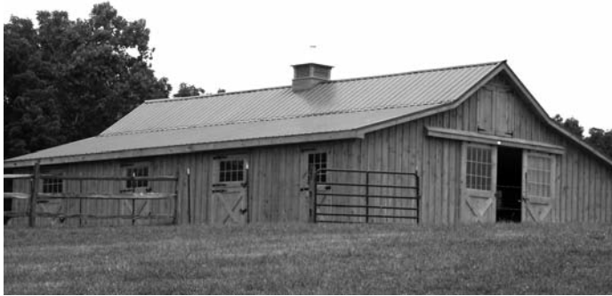
Our new sheep barn

Spring has arrived extra early, and the animals (and staff!) loved the wonderful mild winter we had this past year. Because the grass never really stopped growing, the animals, who started shedding their winter coats in February, enjoyed