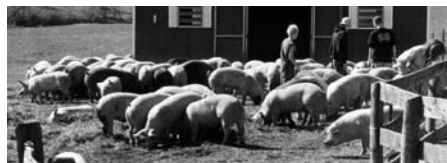
Caring for 167 pigs was a labor of love

While we have had many memorable the most was the “big pig rescue” which occurred when the sanctuary was not even two years old. On October 1, 1998 we received a call from D.C. animal control, telling us that a tractor trailer loaded with 171 pigs from North Carolina, enroute to a slaughterhouse in Pennsylvania, had been abandoned by the driver on a residential street in northeast Washington D.C. It was a very warm day and the pigs, who were crammed so tightly they couldn't even move, had no food or water and four had already died. We immediately agreed to take them, and the humane society towed the vehicle to Poplar Spring. Volunteers from all over the area joined us to help. It took 20 hours to unload the very frightened pigs, as we had to build a large ramp to get them out of the top level. All of the pigs were exhausted, and were covered with scrapes and bruises. As they came out of the trailer they could barely walk, and they collapsed onto the soft beds of hay