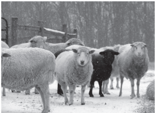
The sheep loved the cold Winter

A fter surviving what felt like the Winter that would never end, Spring could not come soon enough. Although we didn't get much snow (until the end of March!) it was colder than usual, for a much longer length of time. The only ones who didn't mind were the sheep - with their heavy wool coats they were quite comfortable, despite the frigid weather. The rest of us are finally enjoying the sun and warm temperatures once again (and the sheep will be getting sheared soon, so they will be happy too).