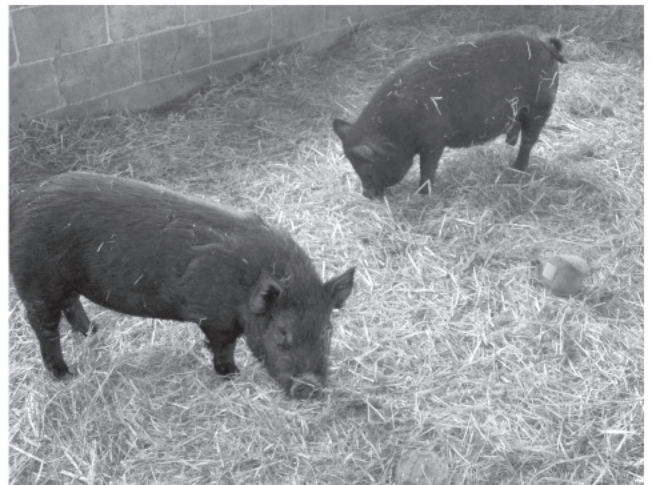
Amelia and Felix, happy and safe

Peace Ridge volunteers drove little Amelia and Felix in the back of their car for an eleven hour journey, traveling all day until they finally arrived late in the evening. After coming out of their crates the excited pigs ran around in their new barn for a short time, then buried themselves in a big pile of straw under a warm heat lamp, snuggled together and fell fast asleep. They were a long way away from their cage in the frozen mud, and now they were safe, and finally home. ■