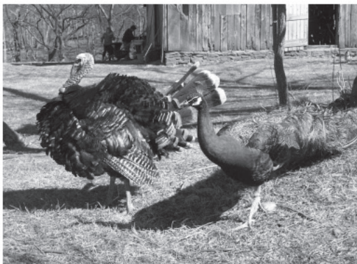
Perry the turkey with friend Edward the peacock

A huge thanks to everyone who attended or generously donated to all of these events, sponsored animals or contributed throughout the year, and helped us to make this another wonderful year! ■