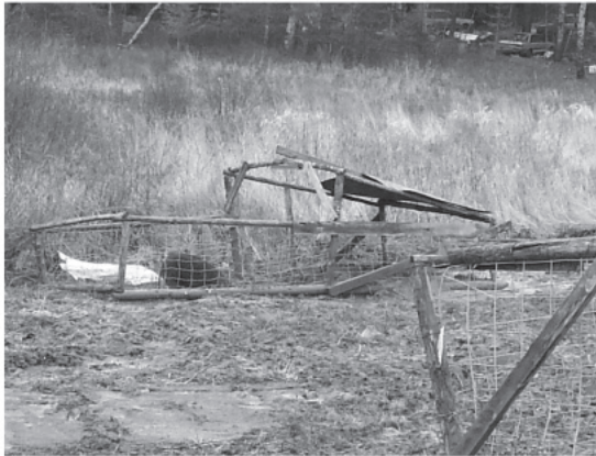
The pig's former "home"

K ept in a pen that was more like a wooden cage, the two little pigs did their best to try to survive the brutal Maine winter, out in the open with no protection from the elements. With nights where temperatures dipped below -10 degrees,