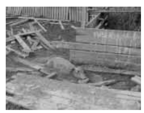
11 pigs starved to death on this farm

Three of these wonderful animals came to live at Poplar – Dina, the tiniest pig, and her good friends Fred and Ethel. The remaining four pigs found loving homes at other sanctuaries. After an initial adjustment period, Dina, Fred and Ethel began to show their playful personalities. Because they were so small, they were able to squeeze out of tiny openings in the pasture fence. They would happily run, play, and stroll around the grounds of the sanctuary every day, stopping at each barn to check for other animal's leftovers. We would