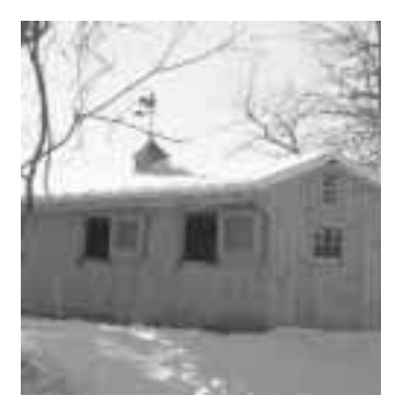
A new barn for the chickens

This winter we received a wonderful gift from the very generous El Ghandour family – a new barn for the chickens. Built by Amish workers and delivered to the sanctuary, this beautiful barn now provides desperately needed extra space for many happy chickens.