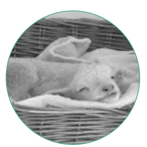
Nap time for Clover the lamb