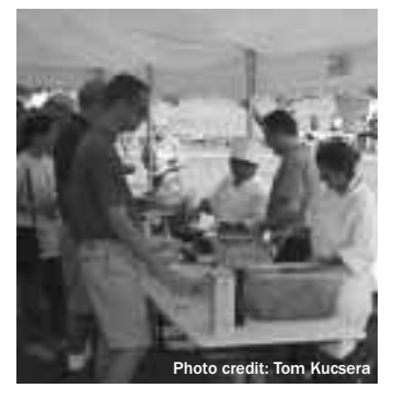
Thyme Square serves visitors at Open House

nother year has come and gone – our eighth year as a sanctuary! We've been busier than ever rescuing many new animals and, as word has spread, offering many more tours to thousands of visitors.